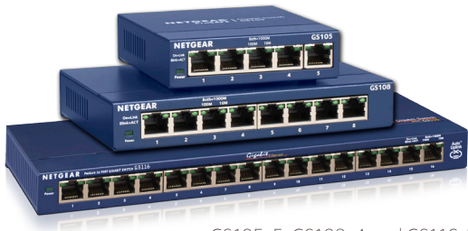
GS105v5, GS108v4, and GS116v2