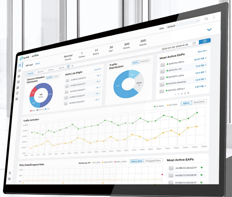
Omada Pro SDN Controller