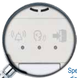
Special model for disabled people