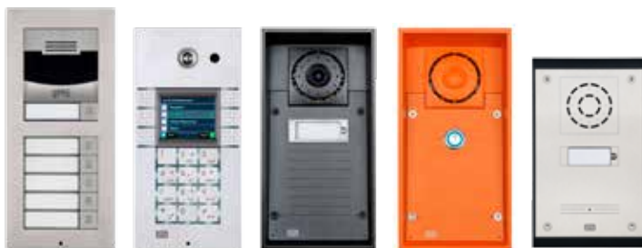
2N® Helios IP Verso